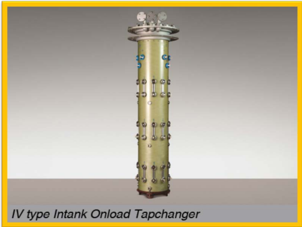
IV type Intank Onload Tapchanger