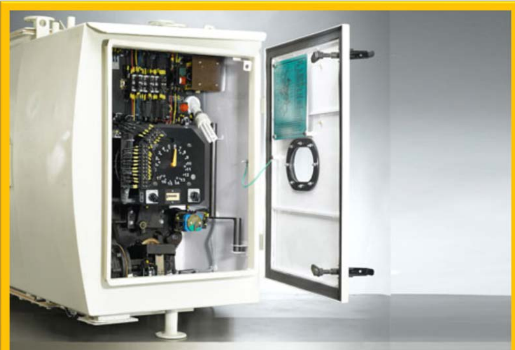
Flange mounted for oil filled transformers