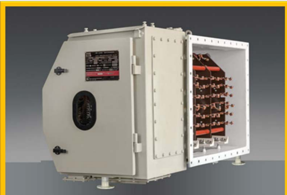
Flange mounted for oil filled transformers